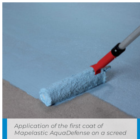
Application of the first coat of Mapelastic AquaDefense on a screed