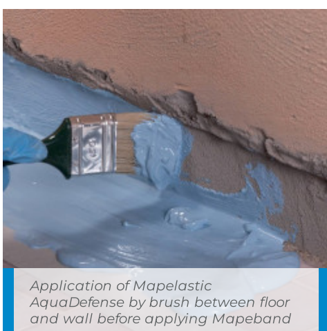
Application of Mapelastic AquaDefense by brush between floor and wall before applying Mapeband