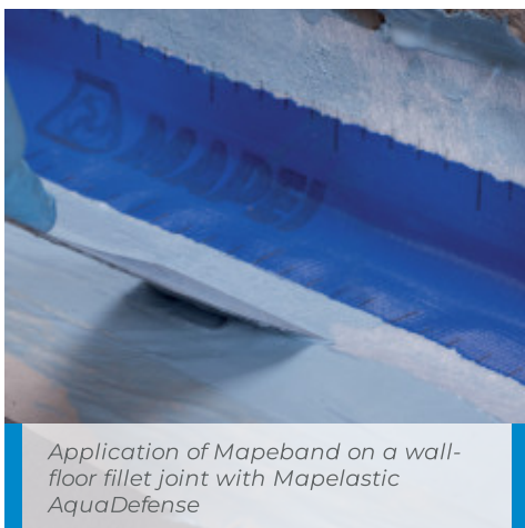
Application of Mapeband on a wall-floor fillet joint with Mapelastic AquaDefense