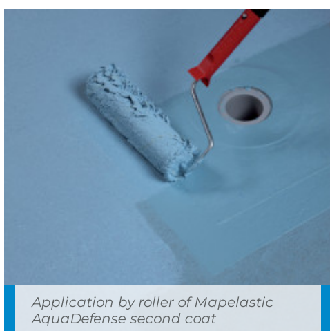
Application by roller of Mapelastic AquaDefense second coat